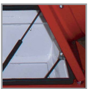
Hinged, tip-up door allows for easy cleaning and accessability.