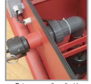
Return pump allows liquid return at 38 gallons/minute.