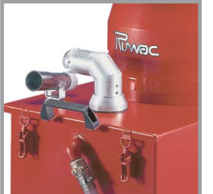
Large top inlet allows chips and other debris to be picked up and separated.